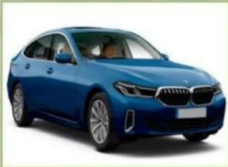
BMW 6 SERIES