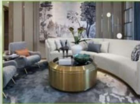
5 BEDROOM HOUSE