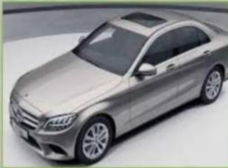
MERCEDES C CLASS