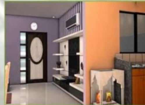
2 BHK APARTMENT

ON ACHIEVING 40 LAKH BP MATCHING - YOU CAN EARN APPROX RS.10 LAKH INCOME