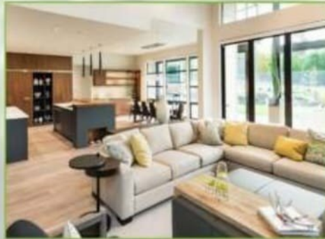
3 BEDROOM HOUSE